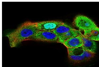
Immunofluorescence analysis of A431 cells using HSF1 mouse mAb (green). Blue: DRAQ5 fluorescent DNA dye. Red: Actin filaments have been labeled with Alexa Fluor-555 phalloidin. Secondary antibody from Fisher (Cat#: 35503)