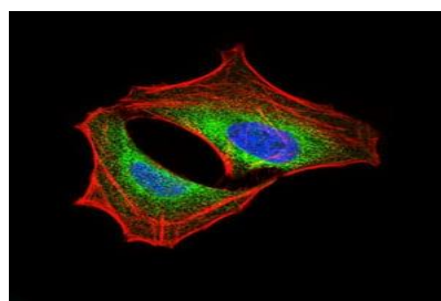
Immunofluorescence analysis of HeLa cells using PIK3R1 mouse mAb (green). Blue: DRAQ5 fluorescent DNA dye. Red: Actin filaments have been labeled with Alexa Fluor-555 phalloidin.