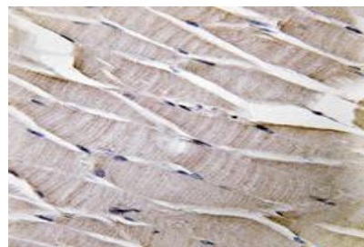
Immunohistochemical analysis of Defensin alpha 3 staining in human skeletal muscle formalin fixed paraffin embedded tissue section. The section was pre-treated using heat mediated antigen retrieval with sodium citrate buffer (pH 6.0). The section was then incubated with the antibody at room temperature and detected using an HRP conjugated compact polymer system. DAB was used as the chromogen. The section was then counterstained with haematoxylin and mounted with DPX.